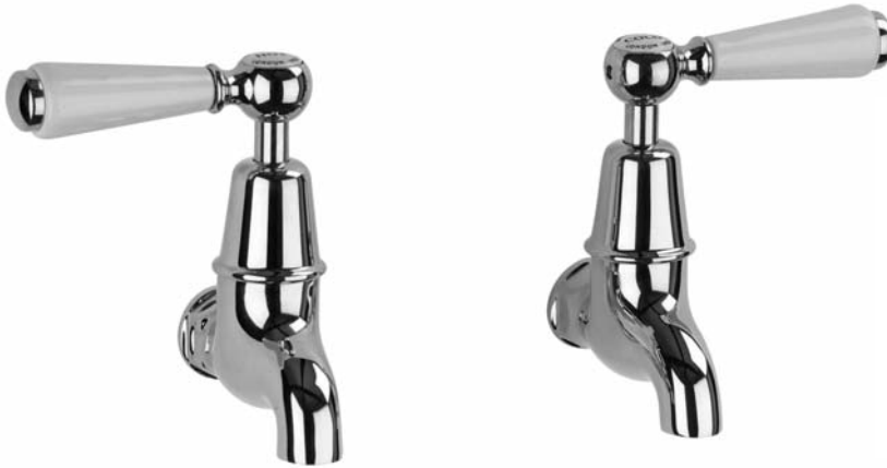
260 1/2" sink bib tap.