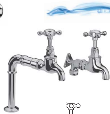
TT284 - 1" extension. TT284 - 2" extension. TT284 - 3" extension. TT284 - 4" extension.