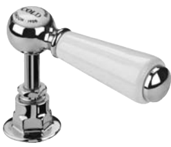
GA with china lever handles (GFC)