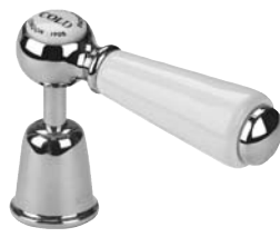
Regent with china lever handles (RFC)